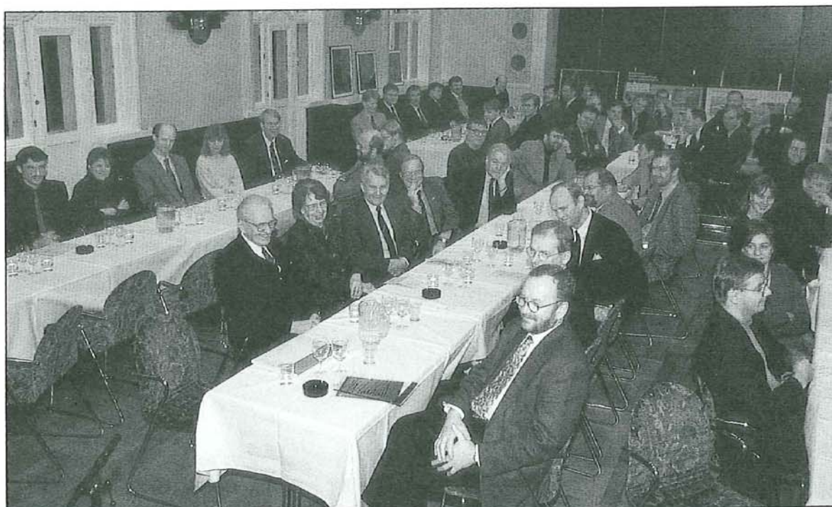
The anniversary meeting was well attended.